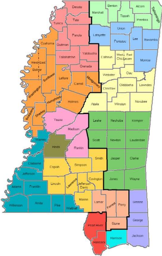
2017-2019 Map of Field Operations